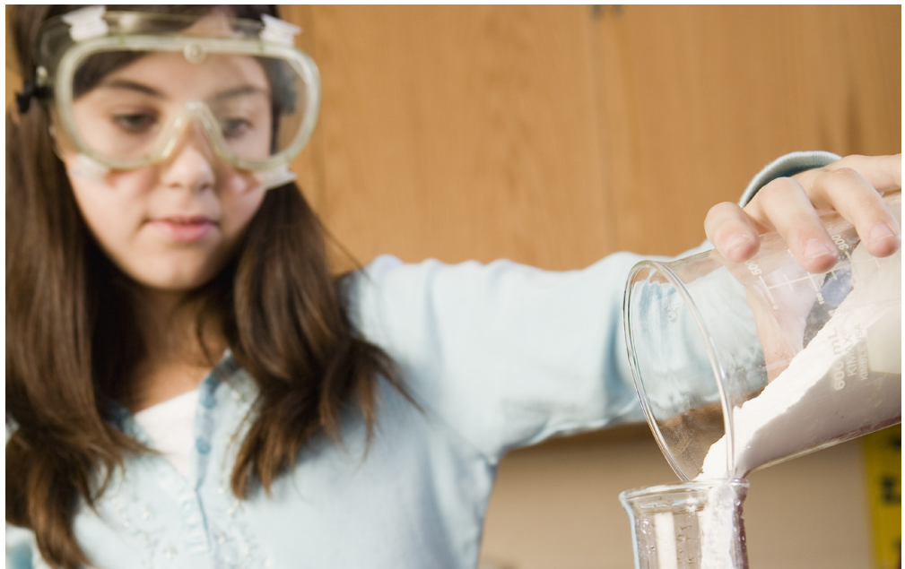
Tom Tits Experiment is Sweden's largest Science Center.

Emergency 112 Police 114 14 Country Code +46 Area Code 08