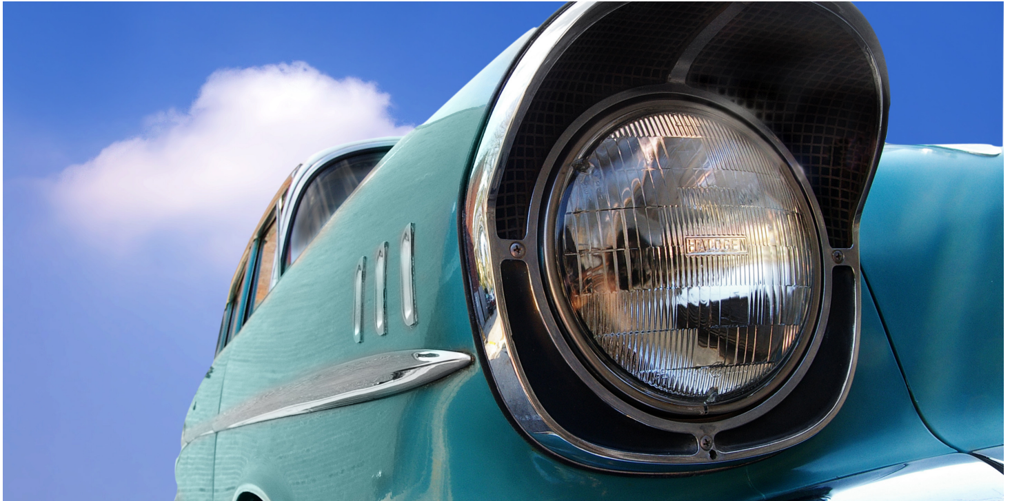
Don't miss The Marcus Wallenberg Hall.