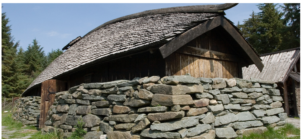
Sweden's first city, "Birka,".