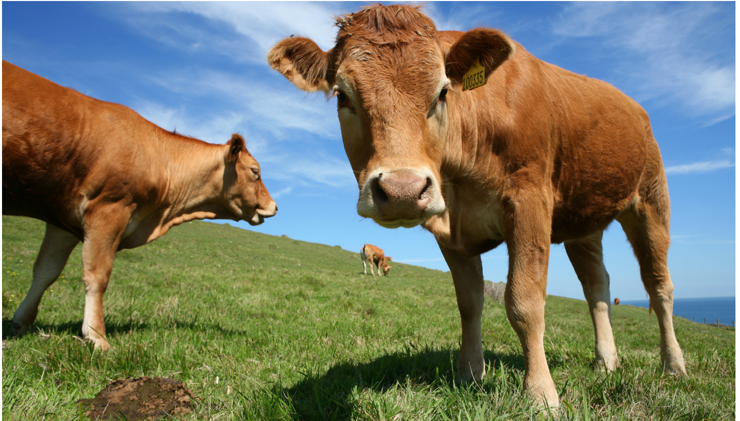
Welcome to the Culture Centre!