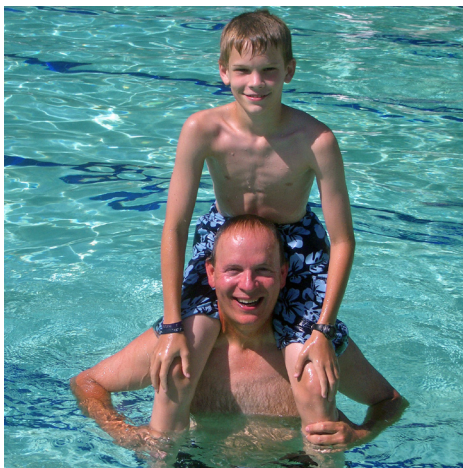
Sydpoolen - Water Adventure.