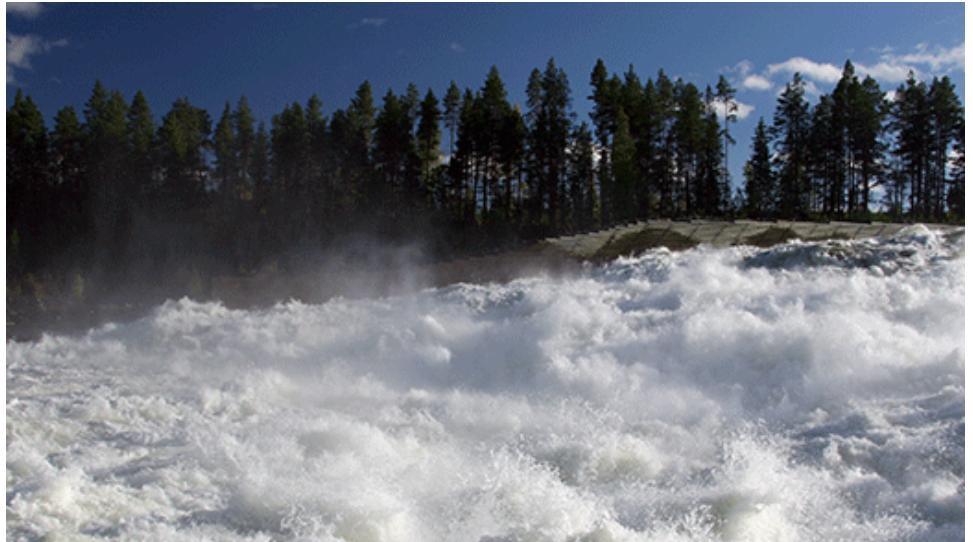
Storforsen Rapids.