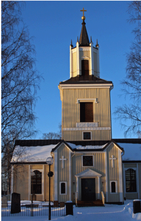
Älvsbyn Church.

For more information contact Älvsbyns Tourist Office.