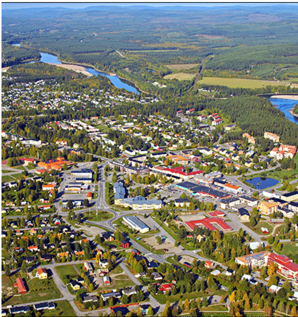
Aerial photo of Älvsbyn.

Emergency 112 Police 114 14 Country Code +46 Area Code 0929