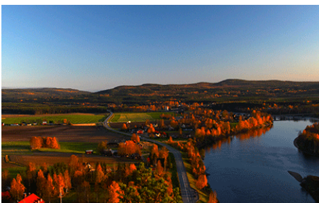
Hundberget Mountain.