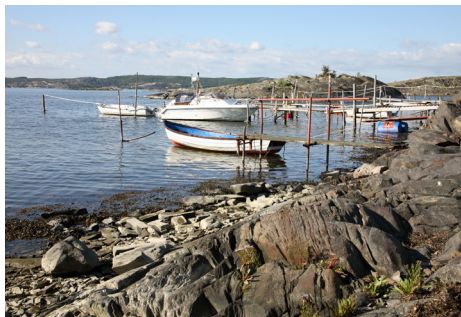
You might see a seal, if you are lucky.