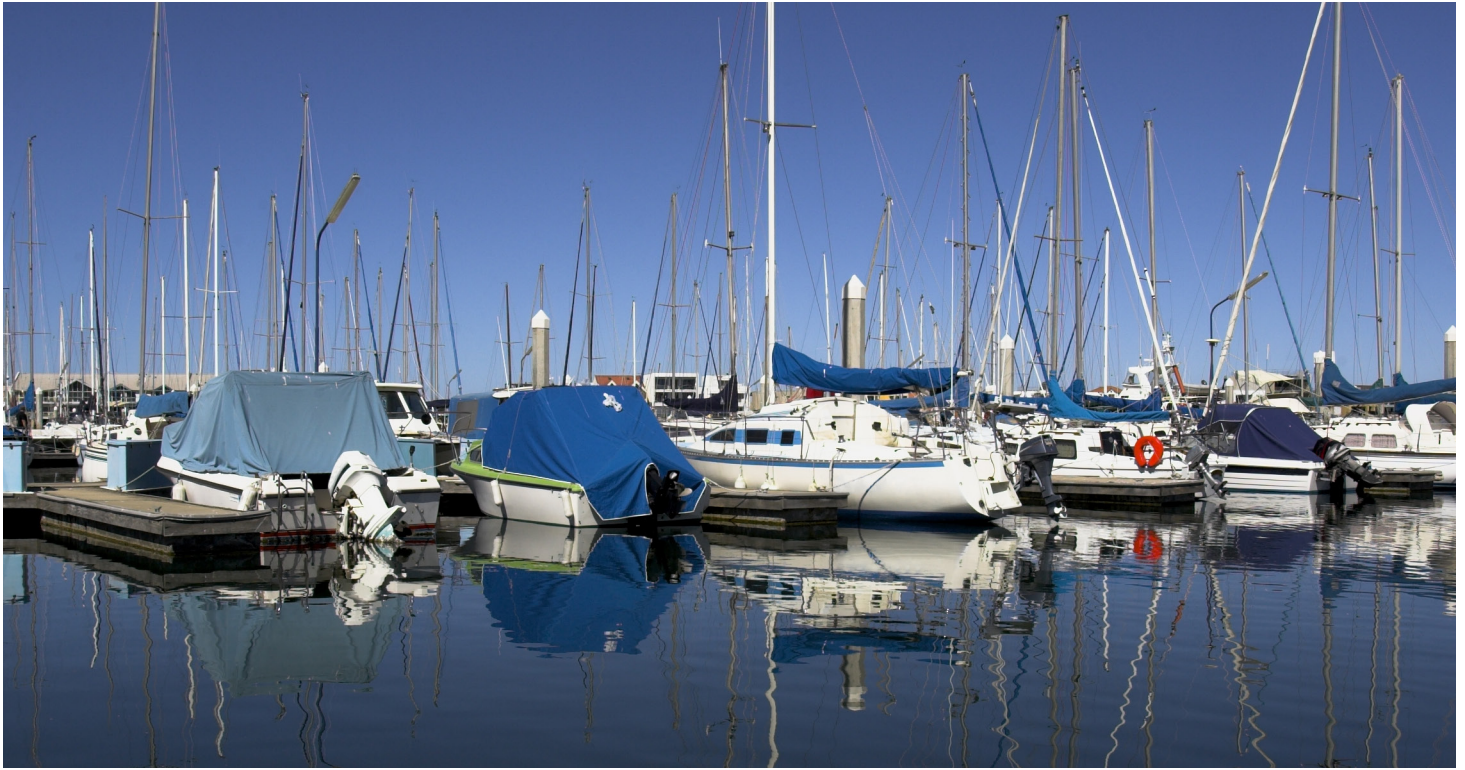
There are many fine guest harbors on Orust.