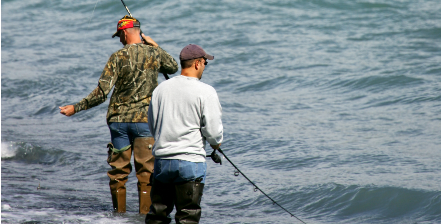
Fish on your own or join a tour.