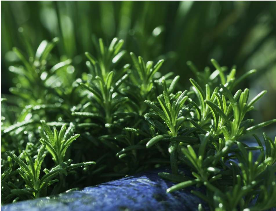
There is a herb section at Orust florist.

department, a harvest home and much more.