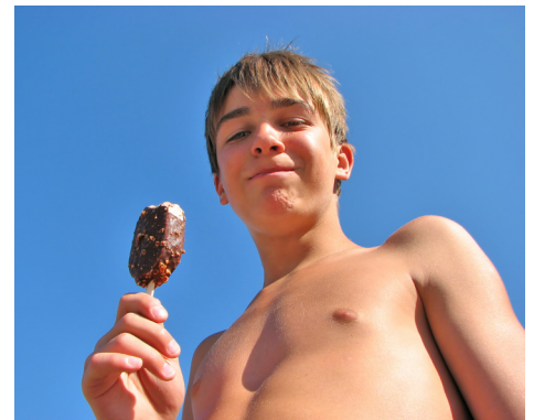
Ice cream tastes extra good in the sunshine.