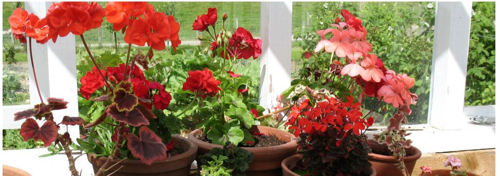
Pelargon Museum is a must for those interested in flowers.