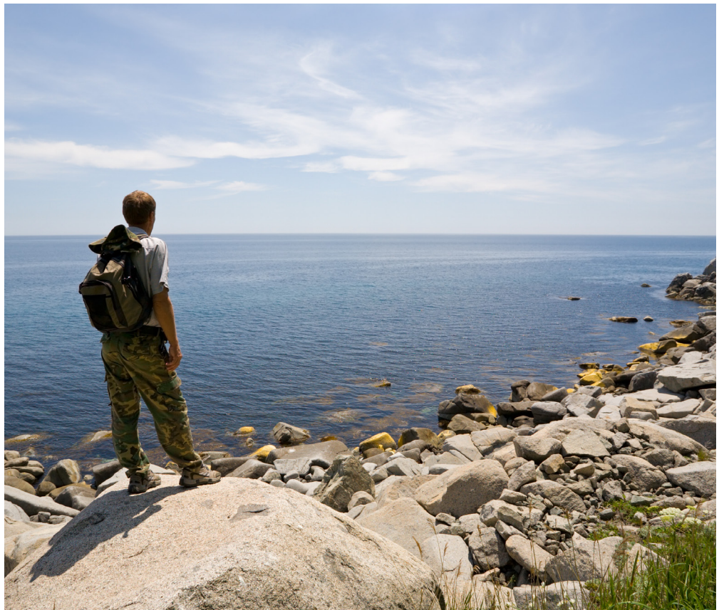
There are many islands to explore.

Emergency 112 Police 114 14 Country Code +46 Area Code 0304