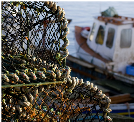
Fishing plays an important role on Orust.