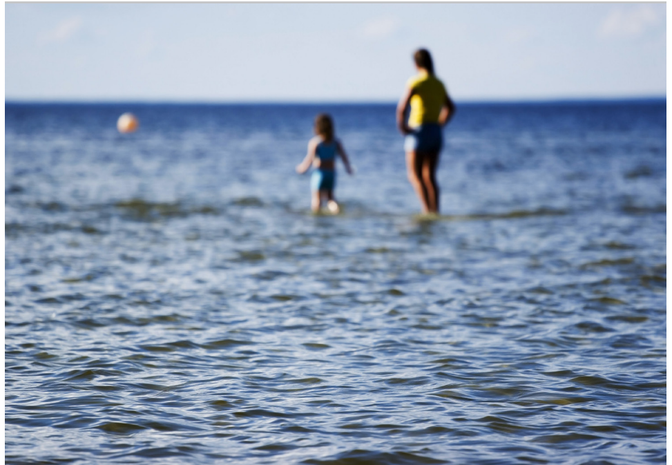
Take a refreshing dip.