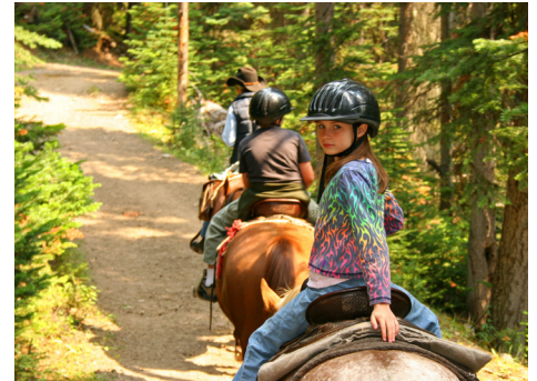
Join a riding tour.

Manufacturing and selling of classic antique lamps with handcasted form and are