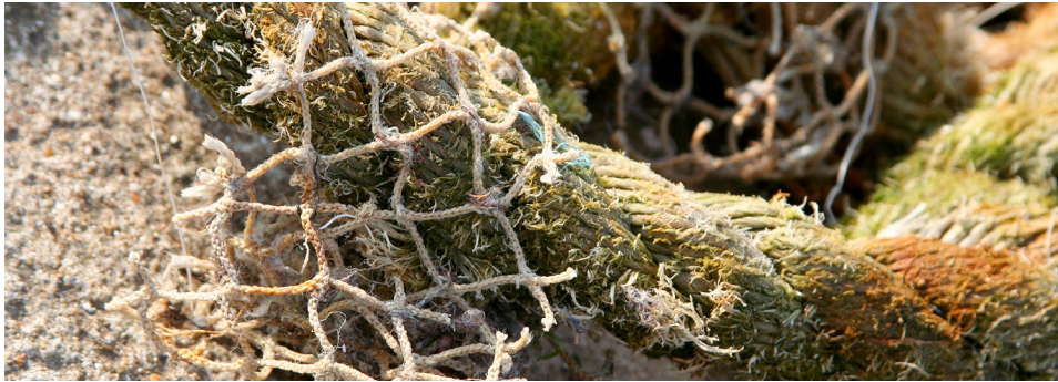
On Mollösund is a 200 year old fisherman's cottage.