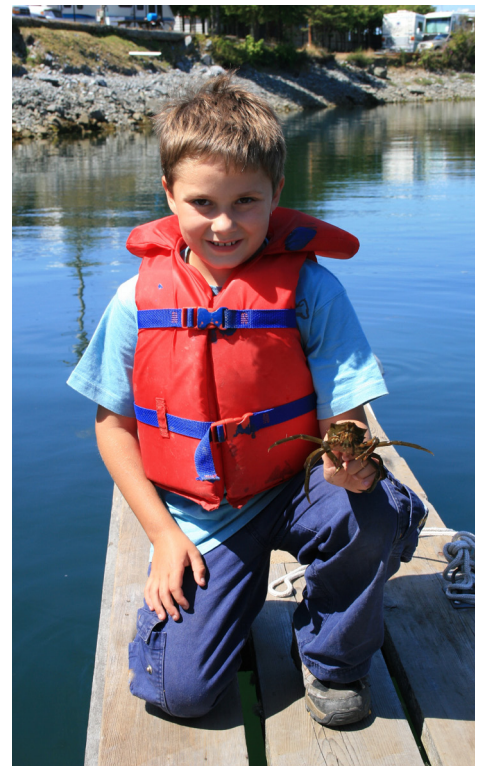
A proud crab fisherman.