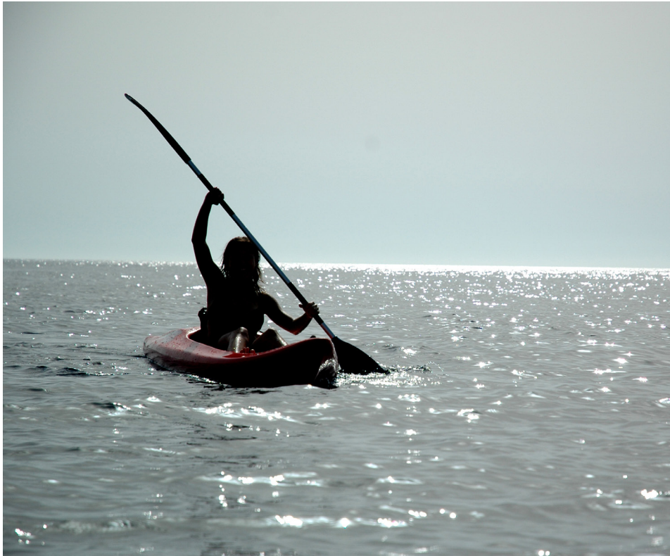
Discover our fantastic archipelago.