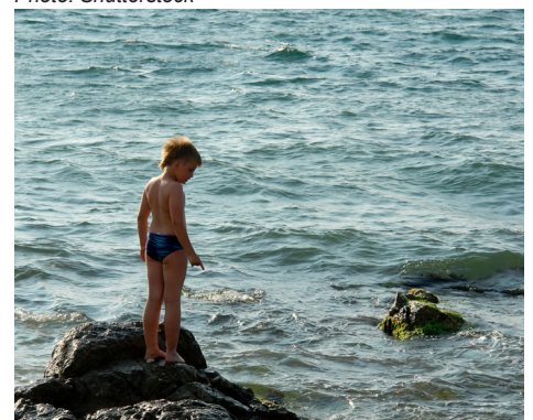
Be careful swimming around the cliffs.