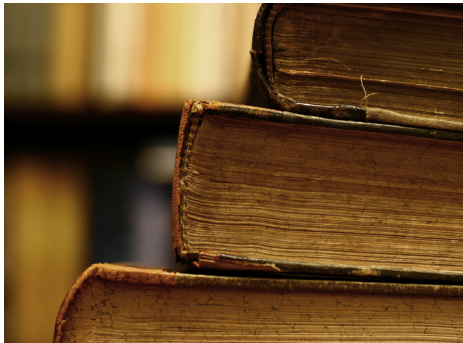
Explore one of our museums.