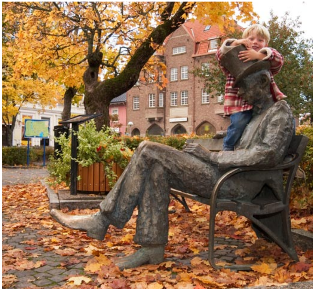
Don't forget to say hi to Nils Ferling when you visit Filipstad.

Filipstads Tourist Bureau Stora torget 3 D (ingång biblioteket) Filipstad +46 590-613 54 www.filipstad.se