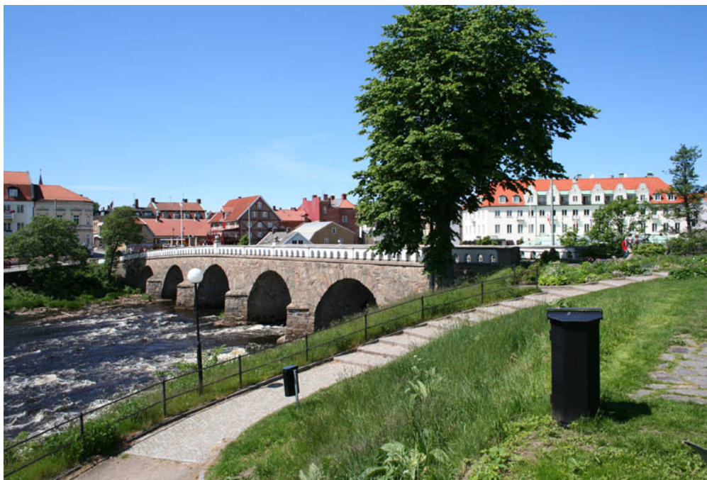
The Toll Bridge in Falkenberg is one of Sweden's most well preserved stone bridges.

Emergency 112 Police 114 14 Country Code +46 Area Code 0346