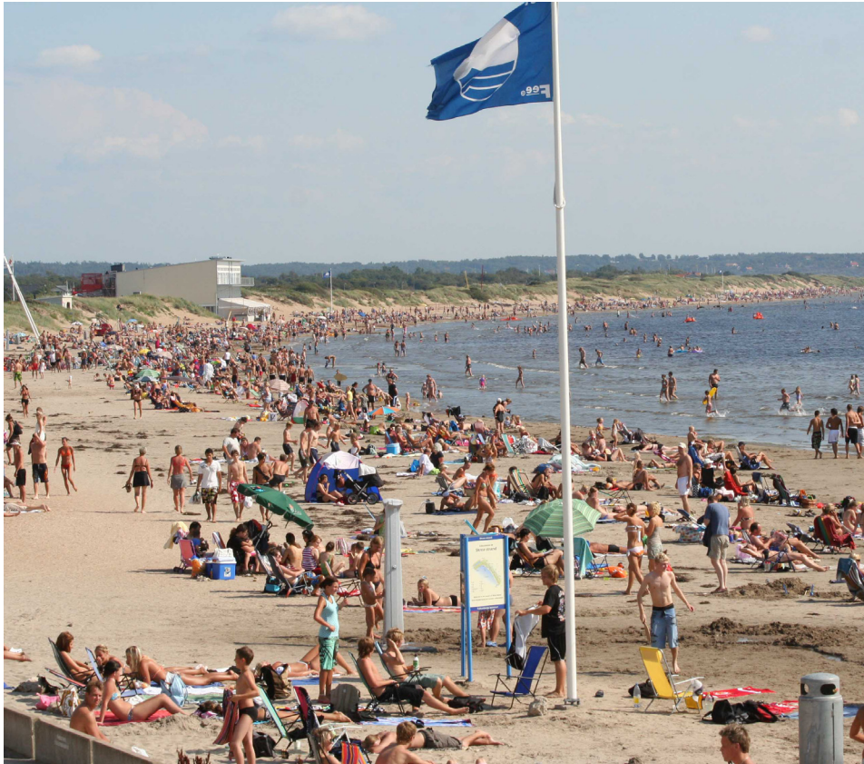
Skrea Beach on a sunny day.