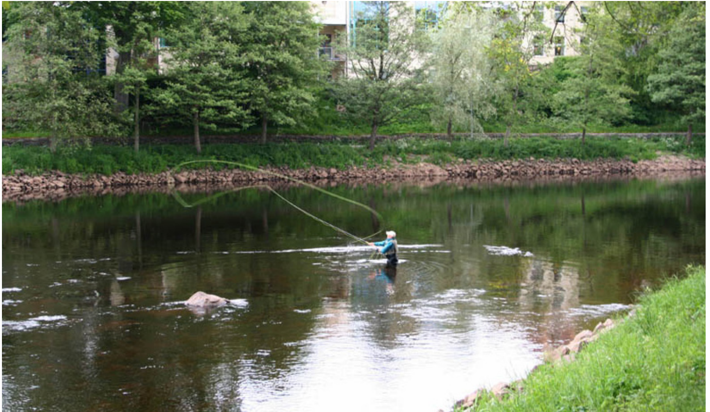
The Ätran River is one of the best for salmon fishing.