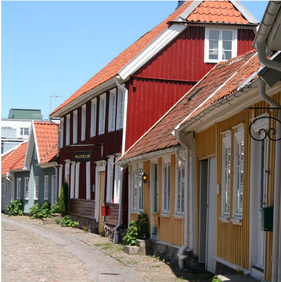
The Old Town in Falkenberg.