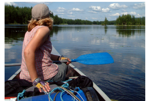
Experience Falkenberg by Canoe.