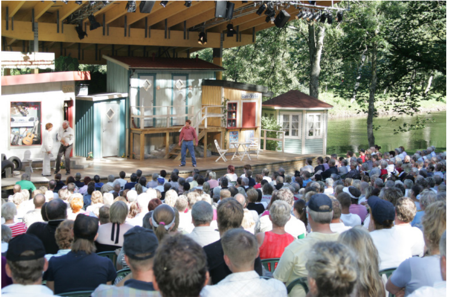
"Sommarfarsen" in Vallarna is very popular.