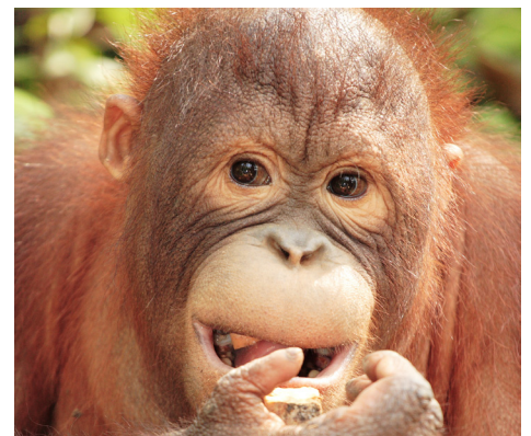
Borås Zoo.