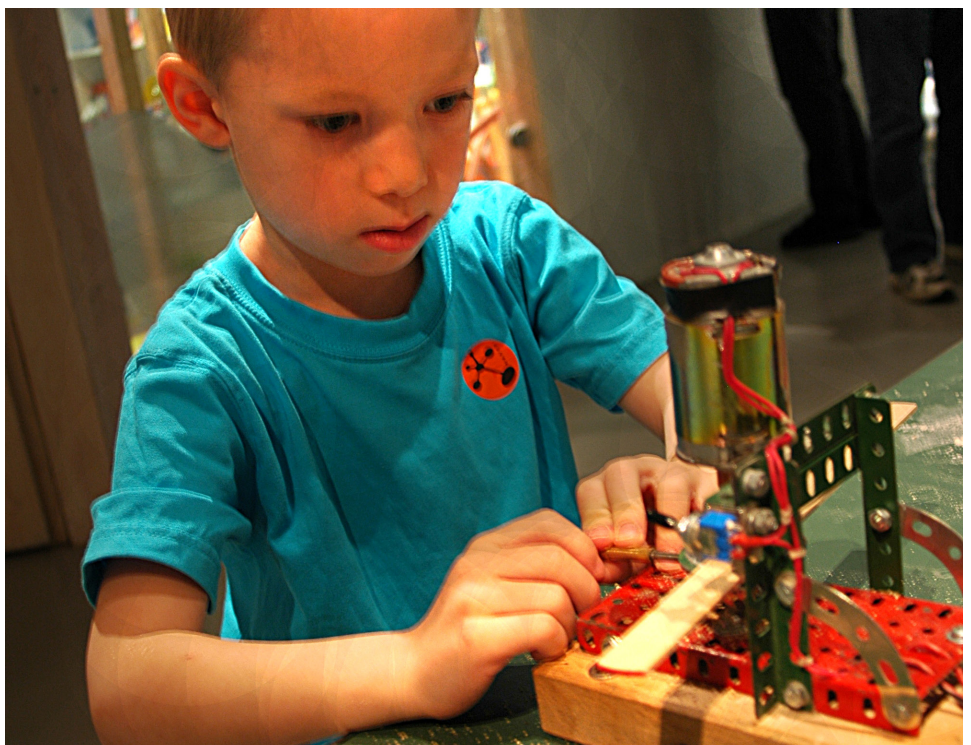
Navet.