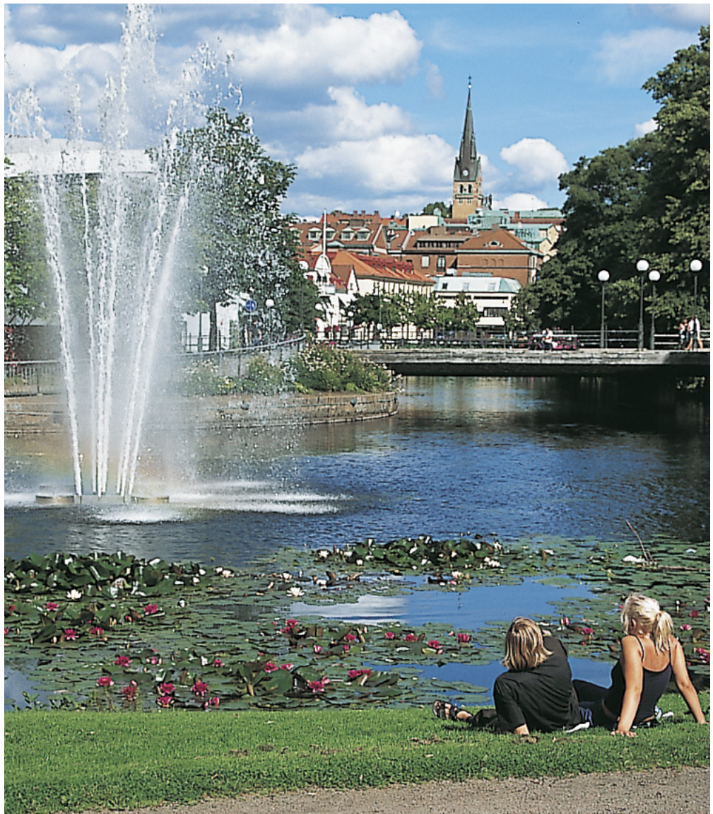
The City park.

Emergency 112 Police 114 14 Country Code +46 Area Code 033