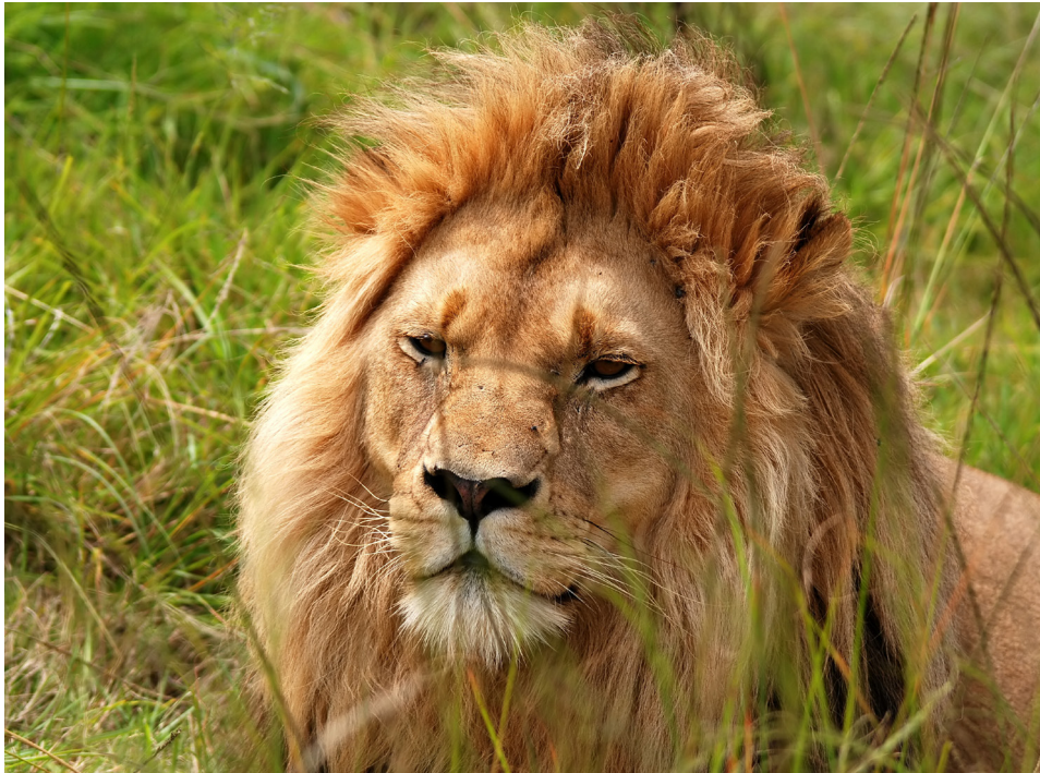
Borås Zoo.