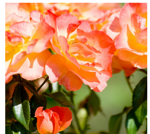
The City Park in Borås.

Along Route 40, West of Borås lies Boråstorpet - Sweden's finest rest area. The old house, which has been thoroughly renovated, is from 1830 but the story begins in the 1790s. In addition to the usual services found at the Swedish Road Administration's resting areas, there are also walking trails, playgrounds and grill area. Boråstorpet is open for easy serving and tourist information from May - September. The Borås Tourist Office can provide you with the opening hours.