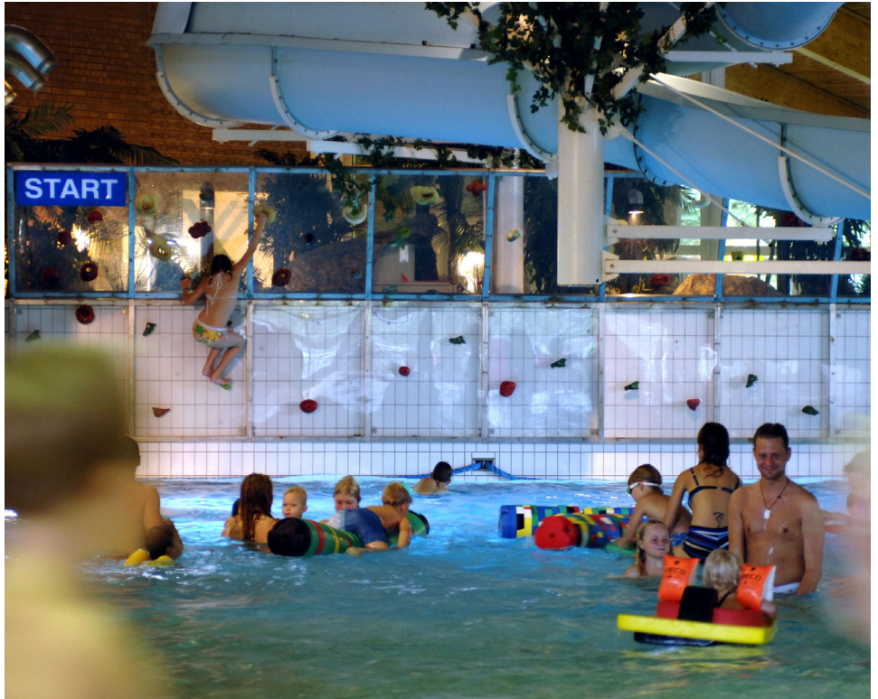
The City Park Pool.