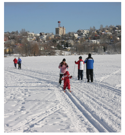
Cross country skiing on a frozen lake.

In the winter you can take a dip through a hole in the ice, skate on natural ice and