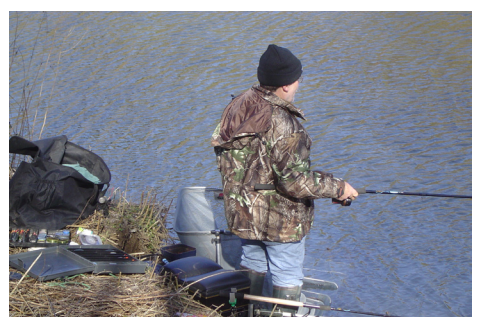
In Tampere, you can fish right in the city.