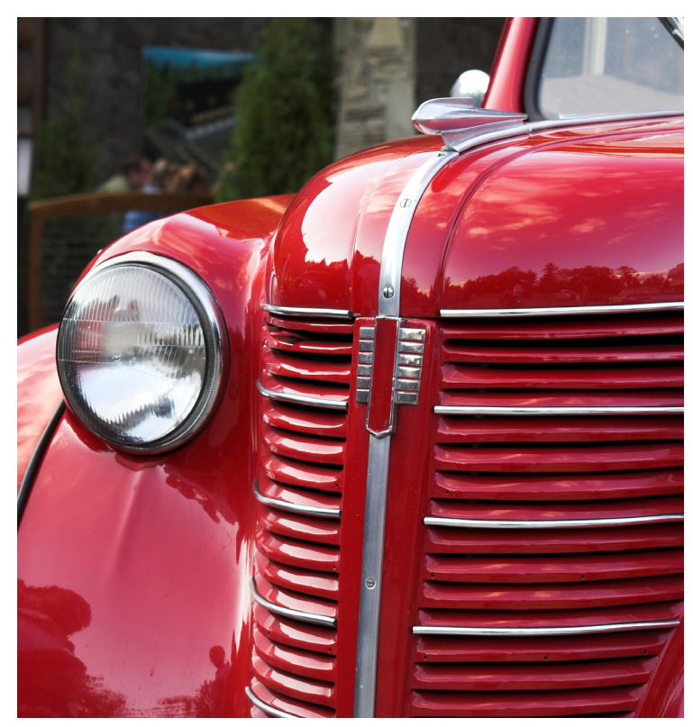
Mobilia is the largest Nordic Museum in its field.