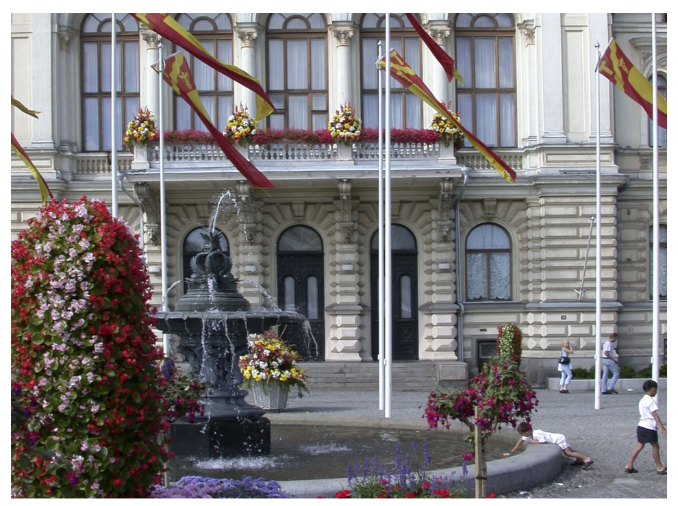
The City Hall in Tampere is one of the city's most beautiful buildings.