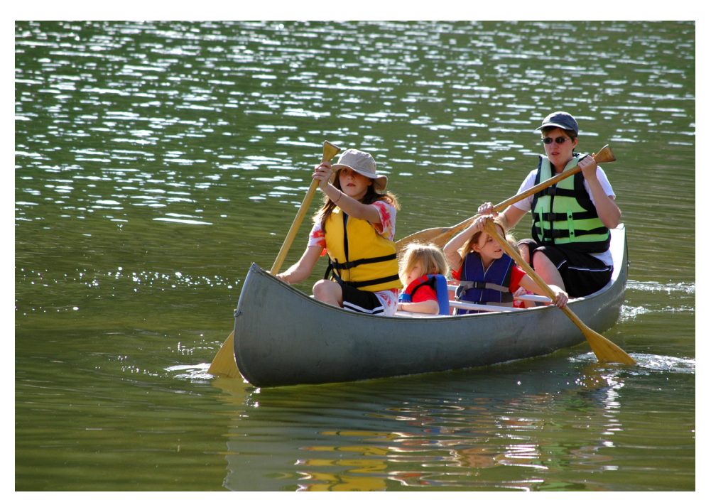
Discover Tampere by canoe.

sled in the beautiful hills - right in the center of town. In Tampere, there are over ten kilometers of lighted track and two slalom runs. An hour drive from the city, In the countryside, are great ski resorts with a wide range of services.