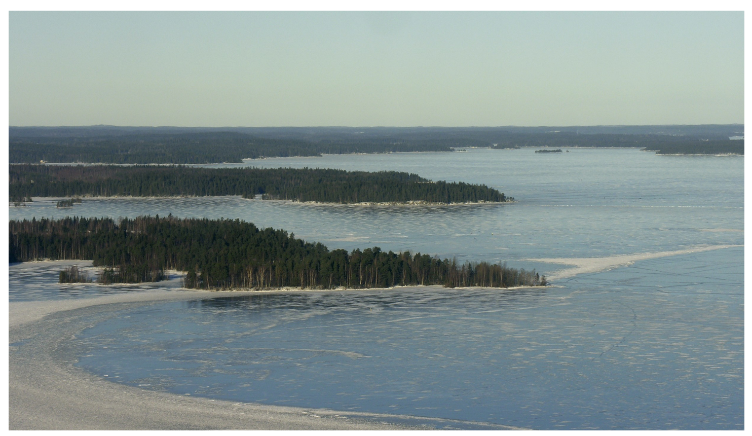
The observatory in Näsinneula has breathtaking views.