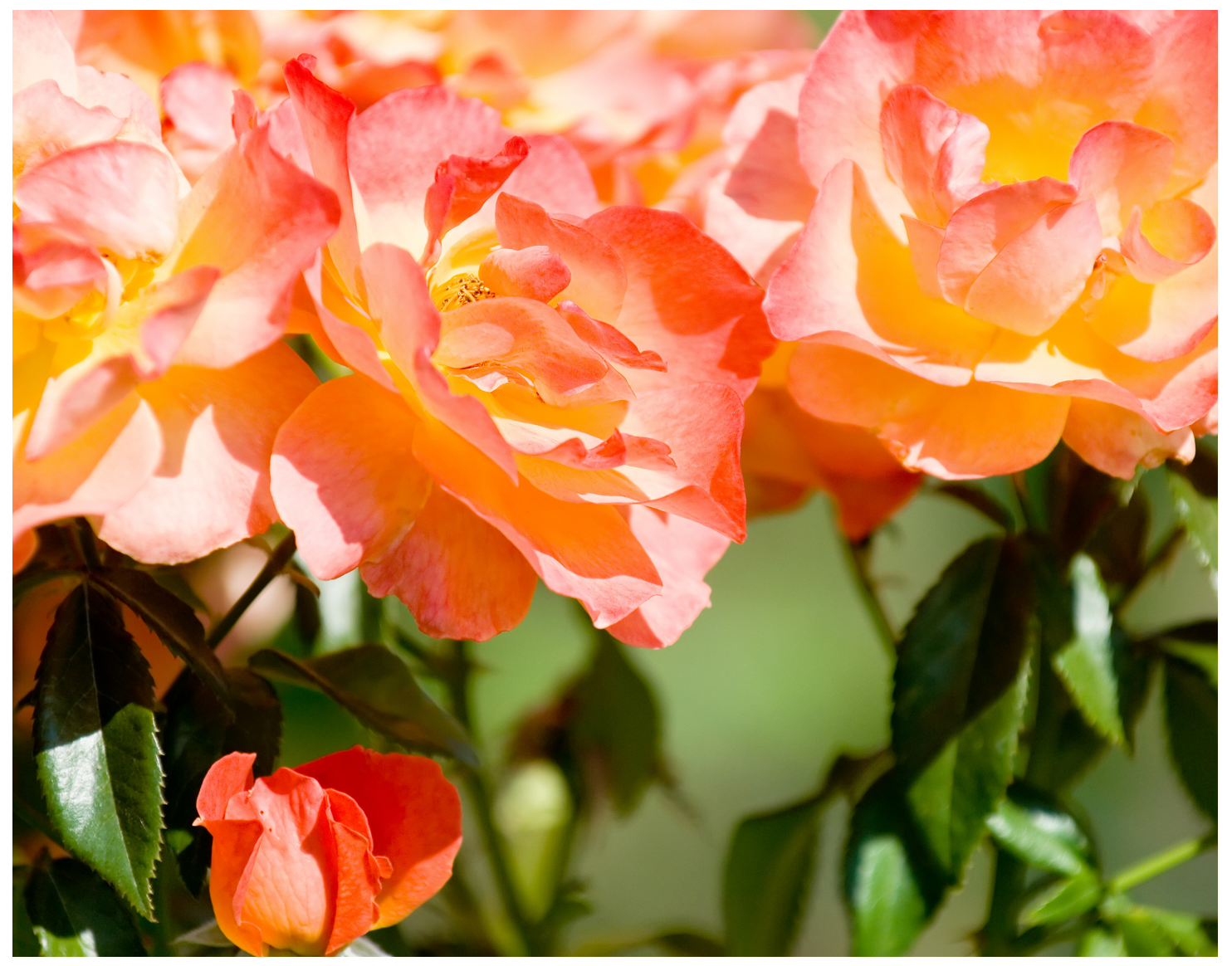
There are many beautiful trails for the nature lovers, including the rose gardens.