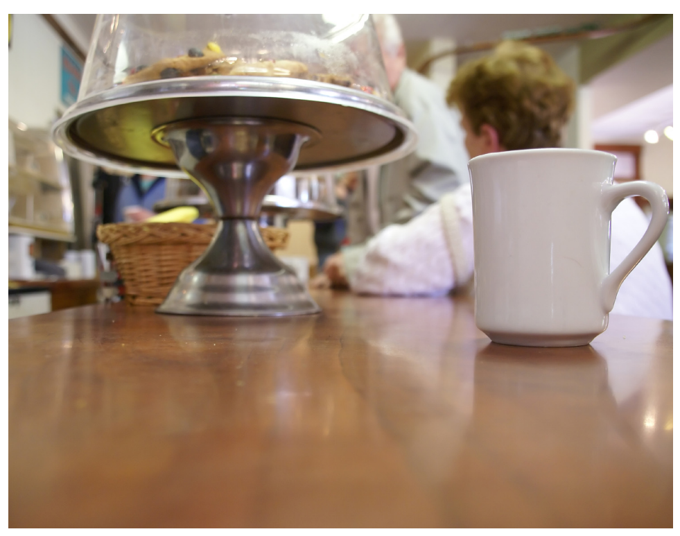
Do like the locals and take a coffee break.

The Czar's footsteps tells about the time when the inland was a grand duchy and belonged to the Imperial Russian Empire. Red Tampere shows cities Finnish labor movement center. Memories of war and returning to the time when the city was a battleground.