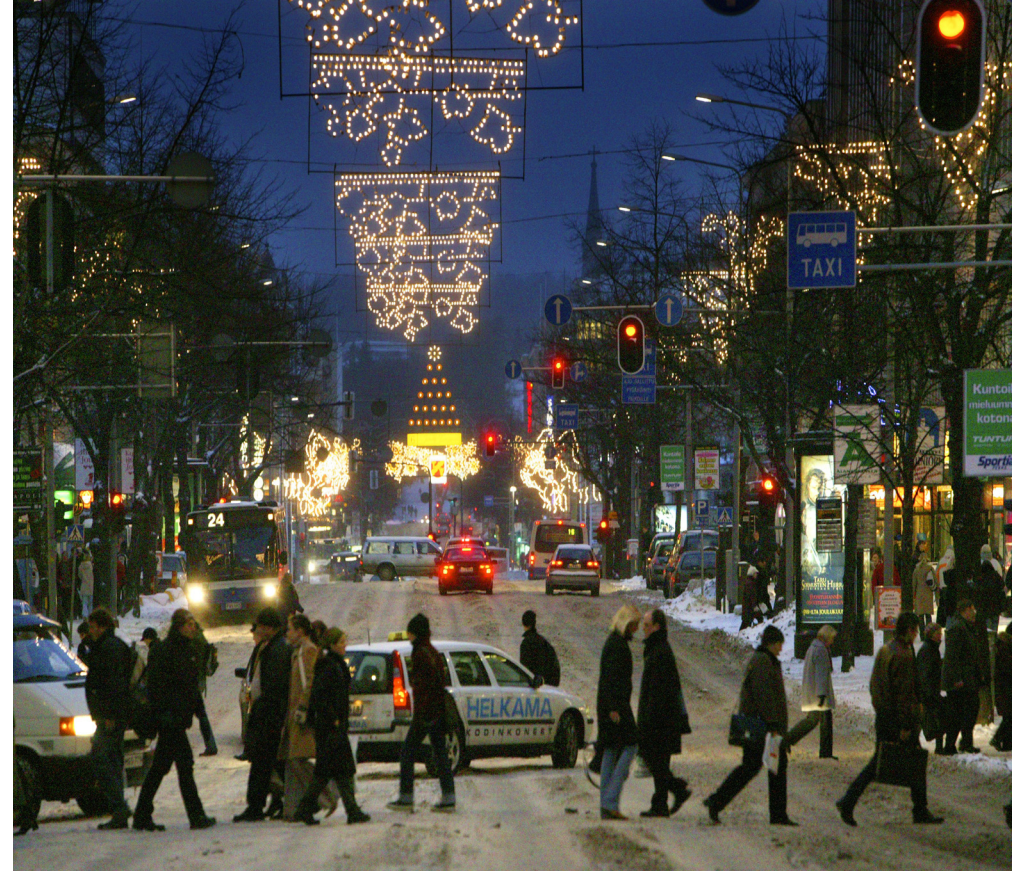
It is easy to get to Tampere. Here you can see the railway station and the city illuminated at night.