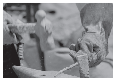
The Handicraft and Industrial Art Center has displays changing exhibitions.

+358 3-375 26 43, summer +358 50-326 75 57, winter